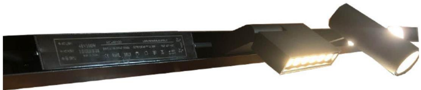
The driver in the rail